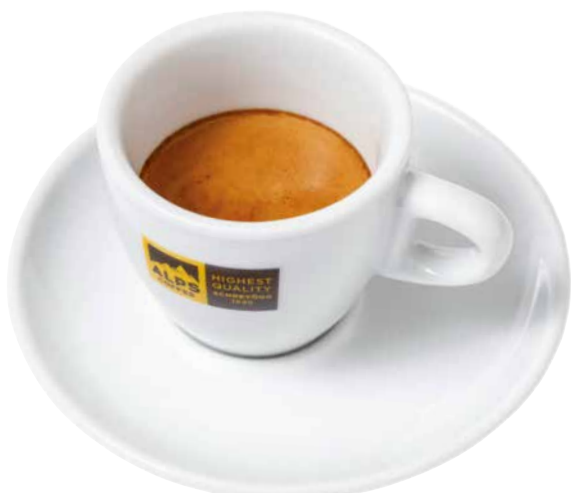
The new cup models from Alps Coffee. For stylish coffee enjoyment.

Brown shades have a special, grounding effect on people. They are associated with experiences to do with earth and nature. The colour brown has a protective impact and creates a balanced, calm mood. But brown is also referred to as a communicative colour. A neutral earth colour, brown can be combined with many other colours.